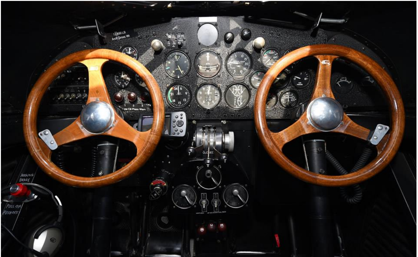
An inside pilot's look at the Ford Tri-Motor.