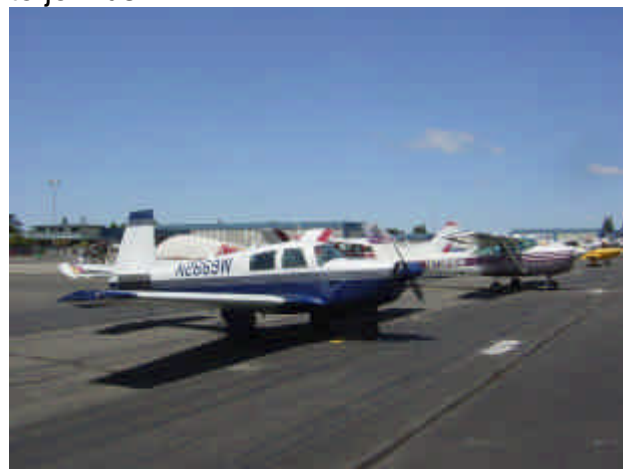
The Mooney, Cessna 182, and Lancair on the ramp.

The fly out took place after the Young Eagles flights. Not all of the pilots were able to join us.