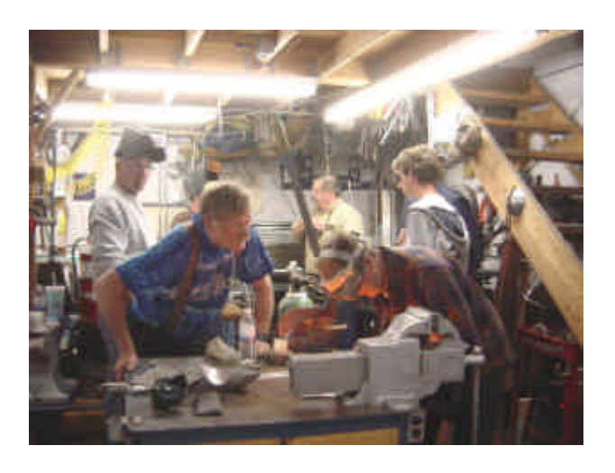
Young Eagles Flights May 27, 2006 Pacific States Aviation

After this introduction, the evening was given over to demonstrations and hands-on practice.