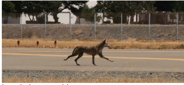
Local airport resident...