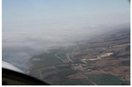
Going back along the coast.