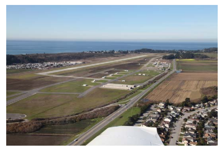
Base leg over Highway 1 on approach to Half Moon Bay Airport

Some photos from a recent fly-out to Half Moon Bay by Tom Howard