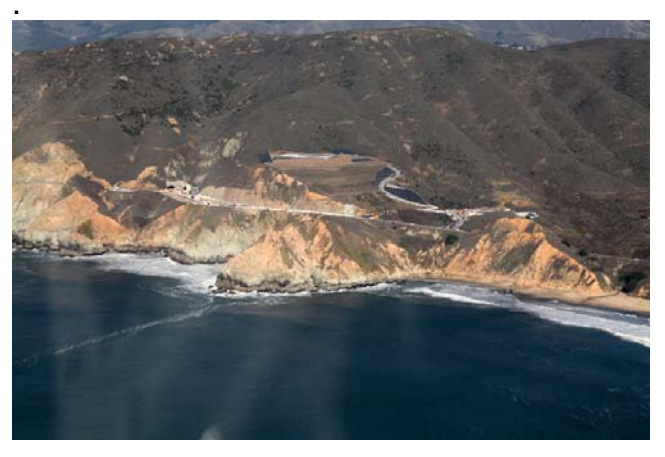
A view of the new Devil's Slide tunnel on Hwy 1