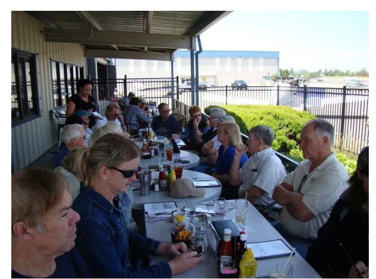
Twenty people arrived in 9 airplanes!