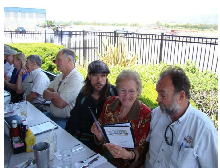
Part of the group.