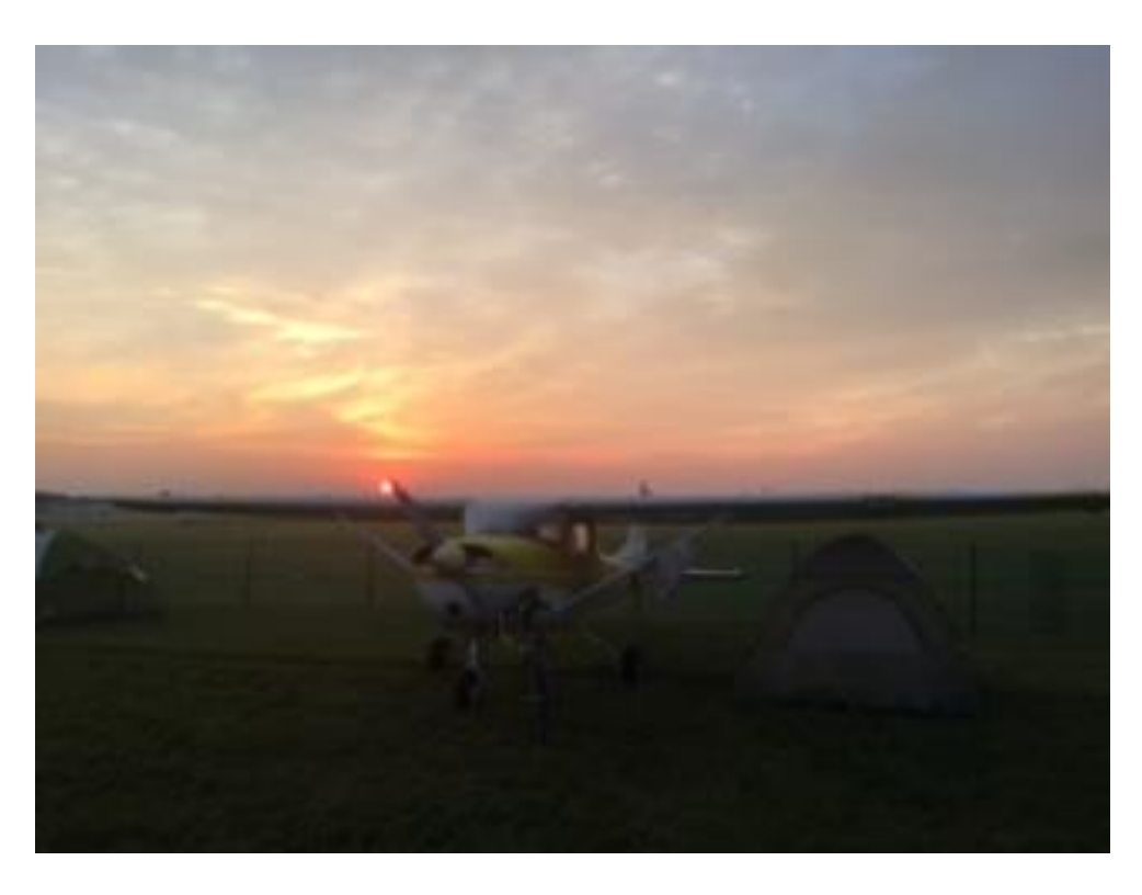
Dawn at Oshkosh