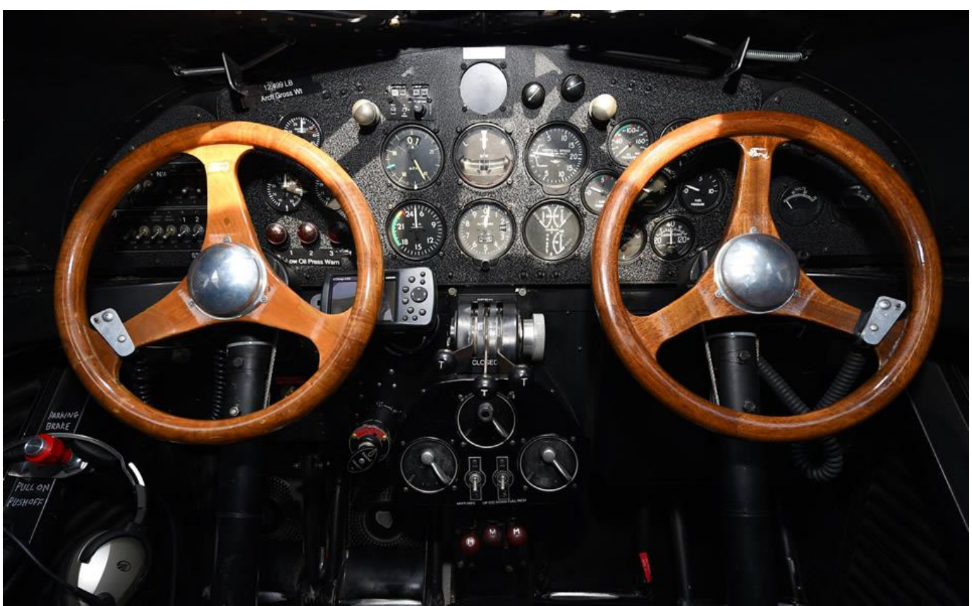
An inside pilot's look at the Ford Tri-Motor.