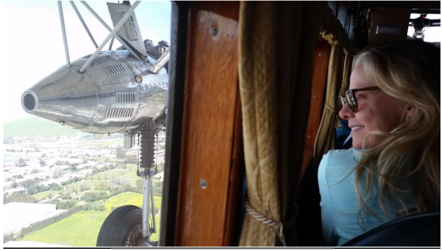
One happy customer flying over concord.