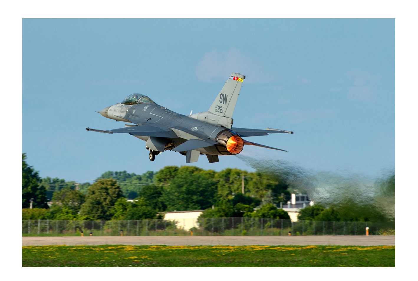
Yo tax dollars at work!