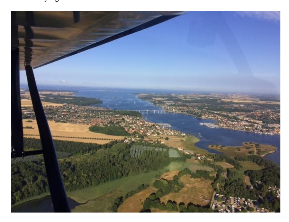
To the right of the bridge is the City of Vindeby (about 50,000 inhabitants). To the left is our home town, Vindeby.

On September 1st our local flying club celebrated 75 year anniversary. A very nice day with many visitors through the day. It is interesting that the flying club was established in 1943, during the German occupation of Denmark, where no Danes were allowed to fly. All GA aircraft had been seized by the Wehrmacht (and were lost). Despite the club members had no runway, aircraft nor licenses they were dreaming about the future, and hoped that the war would end - soon, and they made a flying club.