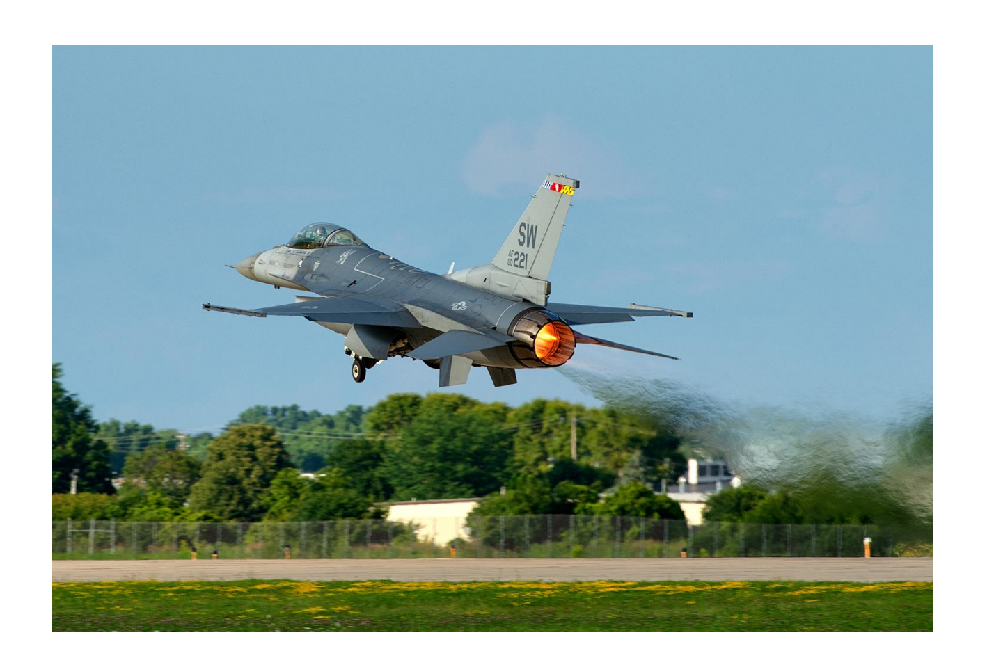
Yo tax dollars at work!