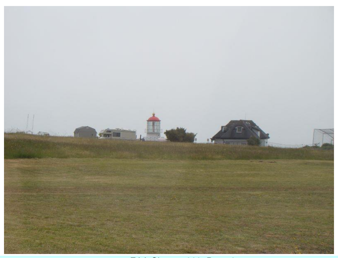
EAA Chapter 393, Page 9