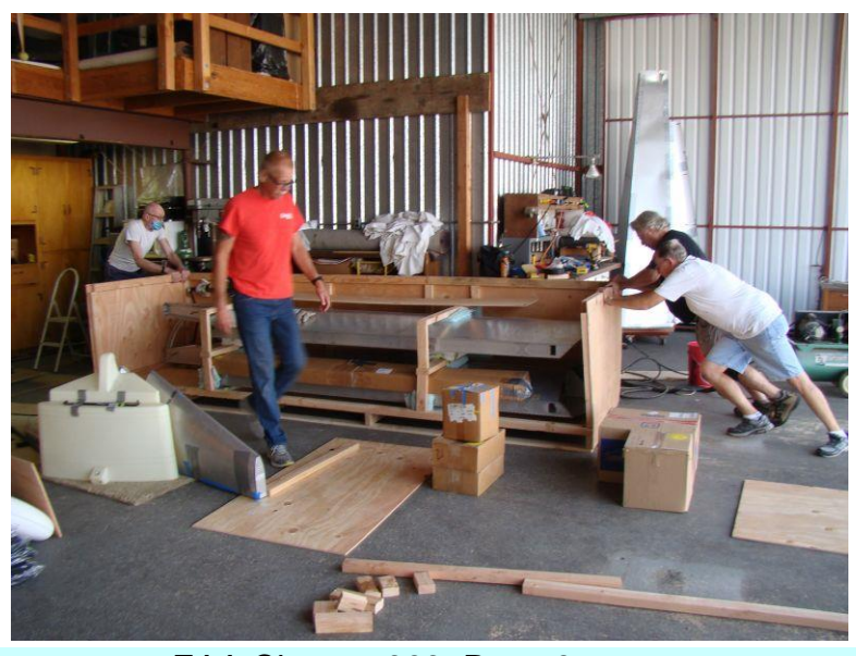
EAA Chapter 393, Page 9