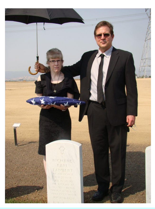
EAA Chapter 393, Page 15