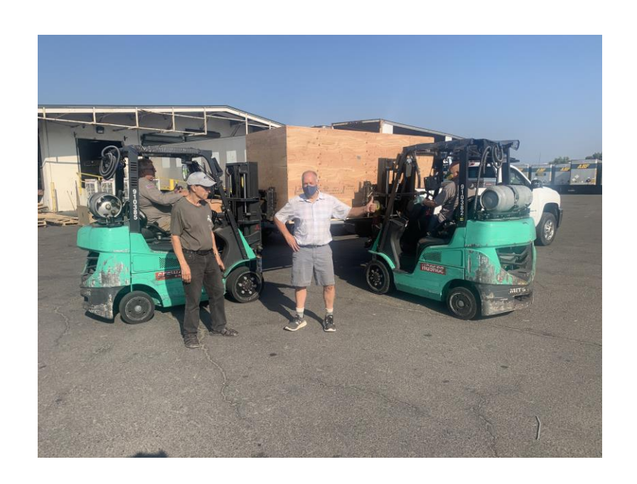
And there's a mission completed!!