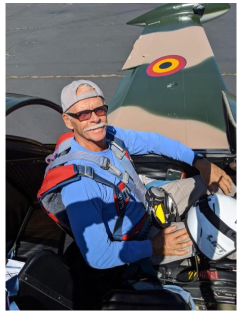
EAA 393 President's Message September 3rd, 2020