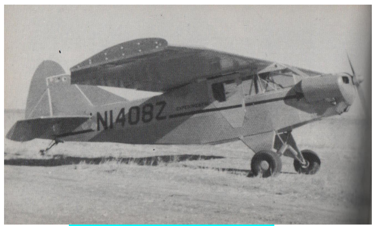
And next, the text, details, history, etc