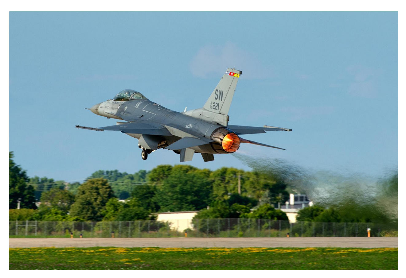
EAA Chapter 393, Page 26