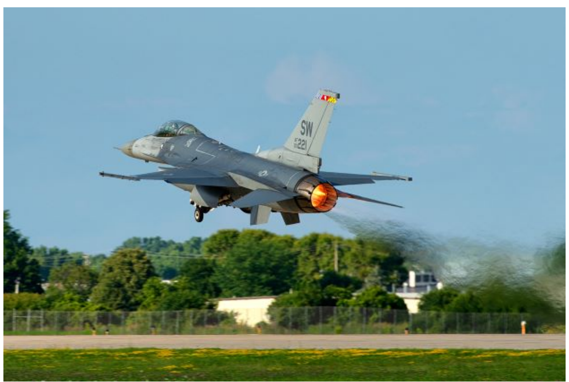
Yo tax dollars at work That's all, folks !!!!!!