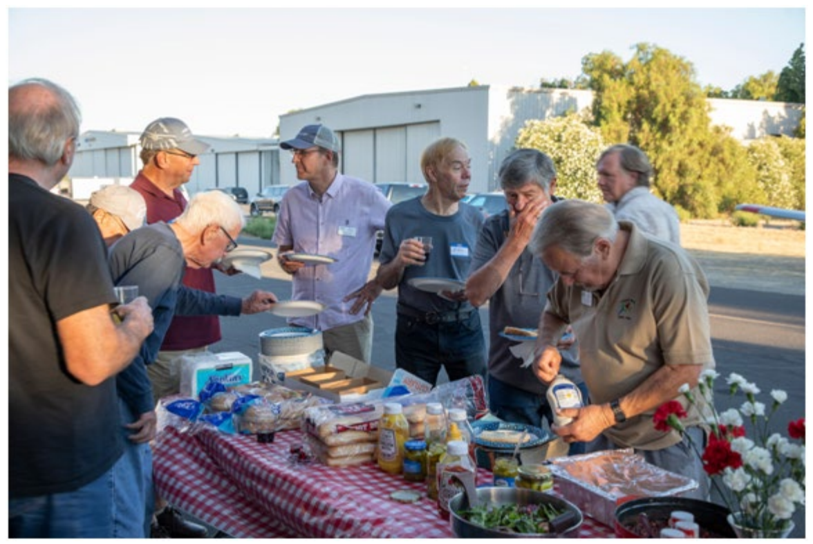
Downhome pot luck dinner prior to meeting. Delicious!