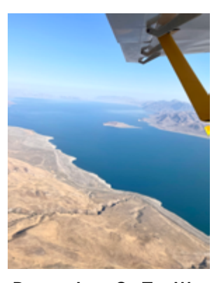
PYRAMID LAKE ON THE WAY То Ірано

The visibility was better Saturday morning and there was a line of planes waiting