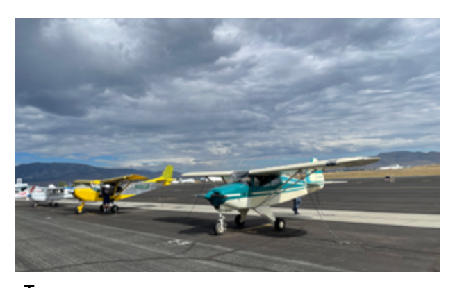
Tuesday morning as the clouds were clearing over Minden.

The visibility that afternoon got down to ½ mile, but the weather forecast was for showers Monday night and Tuesday morning. With this hope, we went out to a great Bar-B-Que place and watched football with dinner. As we headed back to the warehouse, there were a few sprinkles