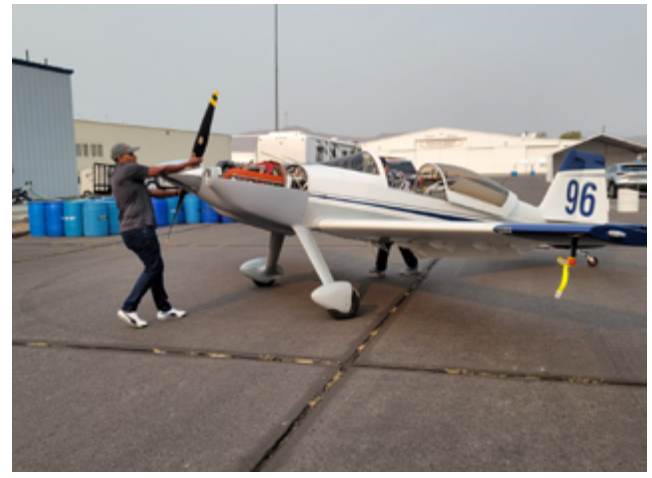
Evo F1 Rocket race #96