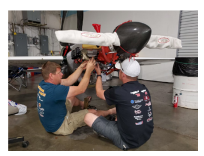
VP crewing on race plane