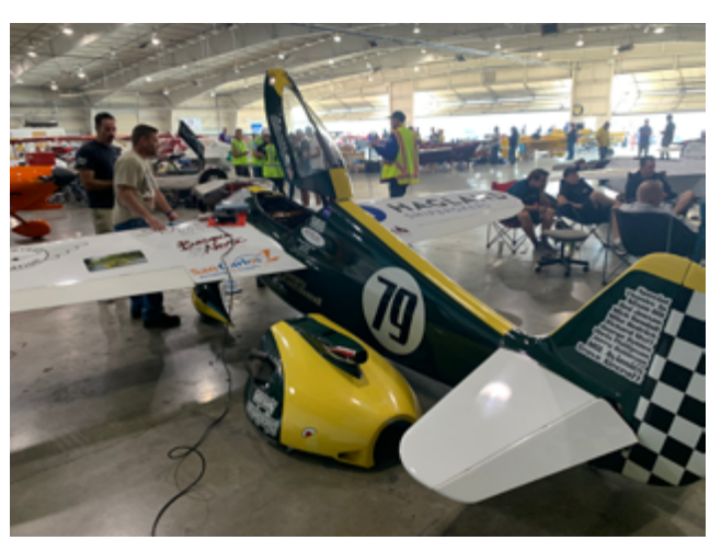
UAL pilot and KC 10 commander USAF