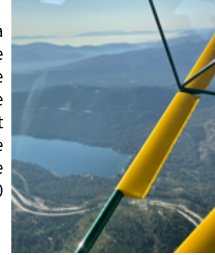
JUST FLEW OVER TRUCKEE AT 8:35. RIGHT ON SCHEDULE

The Zenith got off the runway but stayed in ground effect and would not climb out. Fortunately, Winnemucca