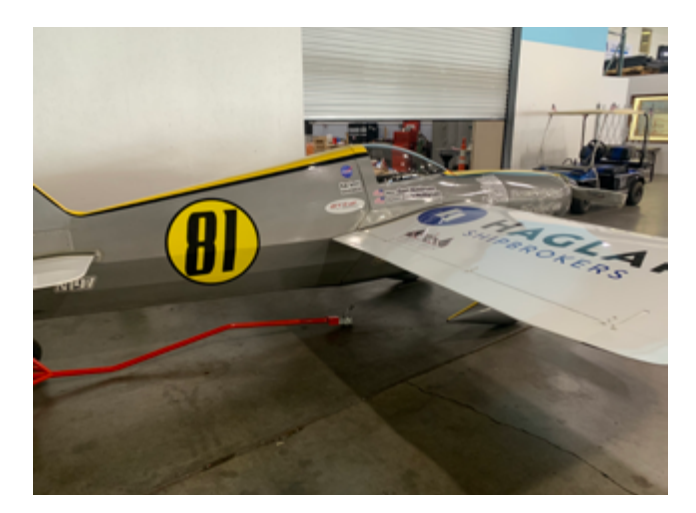
Reno Air Race Pits