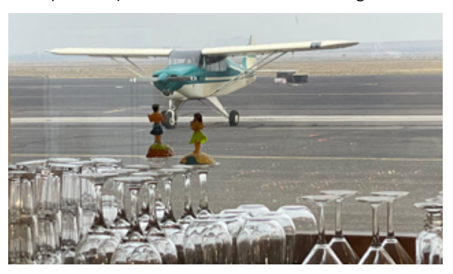
LOOKING AT THE BLUEBIRD FROM THE AIRPORT CAFE.

We were at the railroad museum in Carson City when the wind picked up and the smoke started coming down the