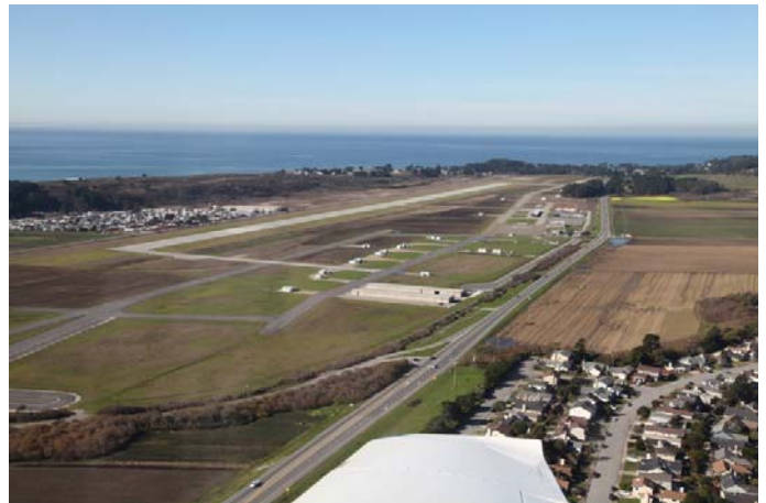
Base leg over Highway 1 on approach to Half Moon Bay Airport

Some photos from a recent fly-out to Half Moon Bay by Tom Howard