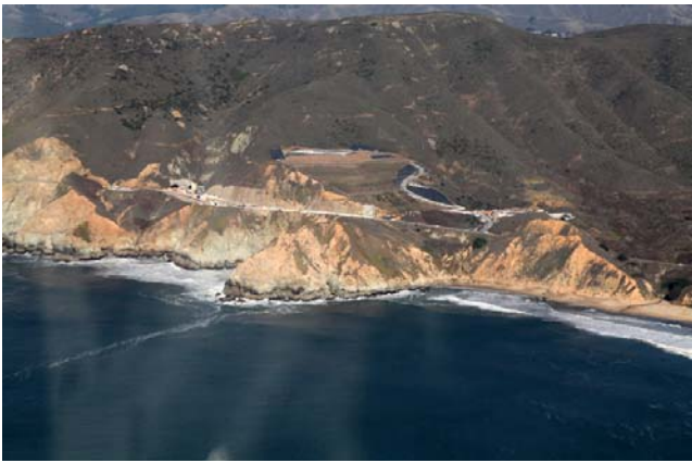
A view of the new Devil's Slide tunnel on Hwy 1